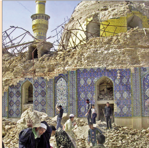
The 2006 destruction of the Askariya Mosque in Samarra, Iraq (above), one of Shiite Islam's holiest sites, sparked sectarian fighting between Shiite and Sunni Muslims in Iraq. This year the bombing of a Sunni mosque in Kirkuk killed 12 and injured 24.

ciated Press, Oct. 15, 2013, www.theguardian.com/world/2013/oct/15/baghdad-mosque-bombing-sunni-worshippers-eid .