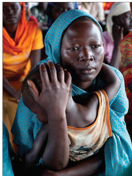
Refugees from Sudan attend church services in a refugee camp in newly independent South Sudan in July 2012. After the south voted for independence in 2011, following a 22-year civil war, thousands of Sudanese Christians in the largely Muslim north fled south, where the new constitution protects religious freedom. Sudan's imposition of draconian Islamic law, or Sharia, sparked the war.

N early 75 percent of the world's inhabitants — 5.1 billion people — live in countries that restrict religious freedom, a fundamental human right under international law. Draconian antiblasphemy laws, threats of imprisonment, physical attacks and the desecration of holy sites are among the tools used to stifle religious expression. Many foreign policy experts see religious oppression as a serious threat to global stability. Advocates in the United States are pushing policymakers to make religious freedom a higher priority, arguing that promoting it abroad will help defuse tensions and foster peace and democracy. But others say that making religion a focus of foreign policy is a mistake because it is too complex and volatile an issue. Meanwhile, some countries, such as newly independent South Sudan, have taken noteworthy steps to broaden religious rights.